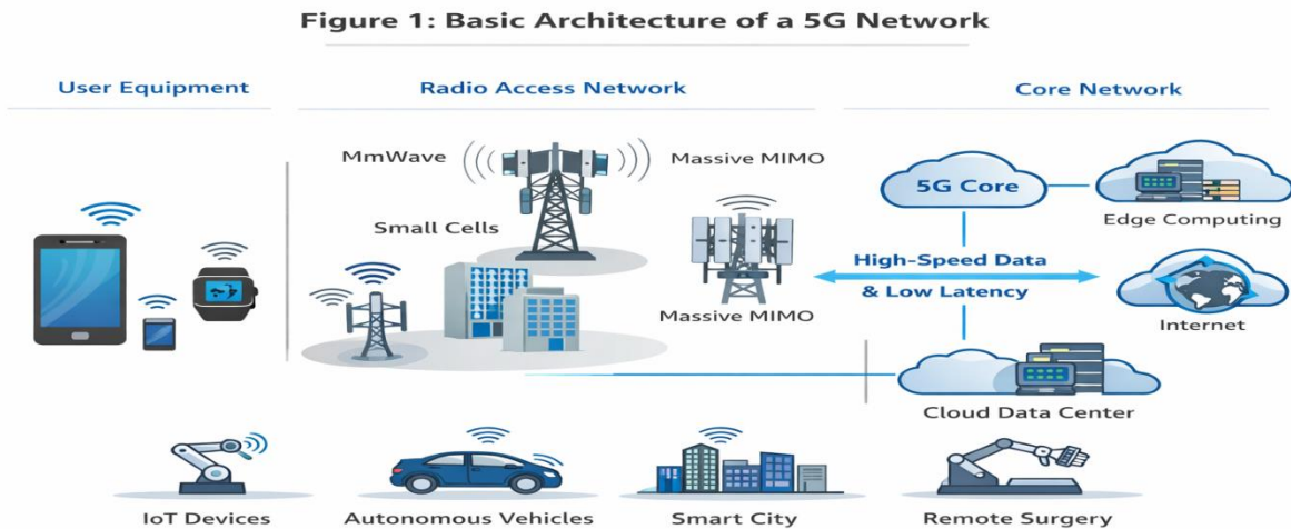
Figure 1: Basic Architecture of a 5G Network

A critical aspect of 5G technology is its network architecture. It extends beyond traditional radio access technologies (RATs), integrating advanced models such as millimeter-wave (mmWave) communications, dense small cell deployment, and massive MIMO systems to enhance capacity and coverage. The architecture described by Ibrahim et al. (2021) highlights IP-based models for interoperability and robust handover systems between heterogeneous networks.